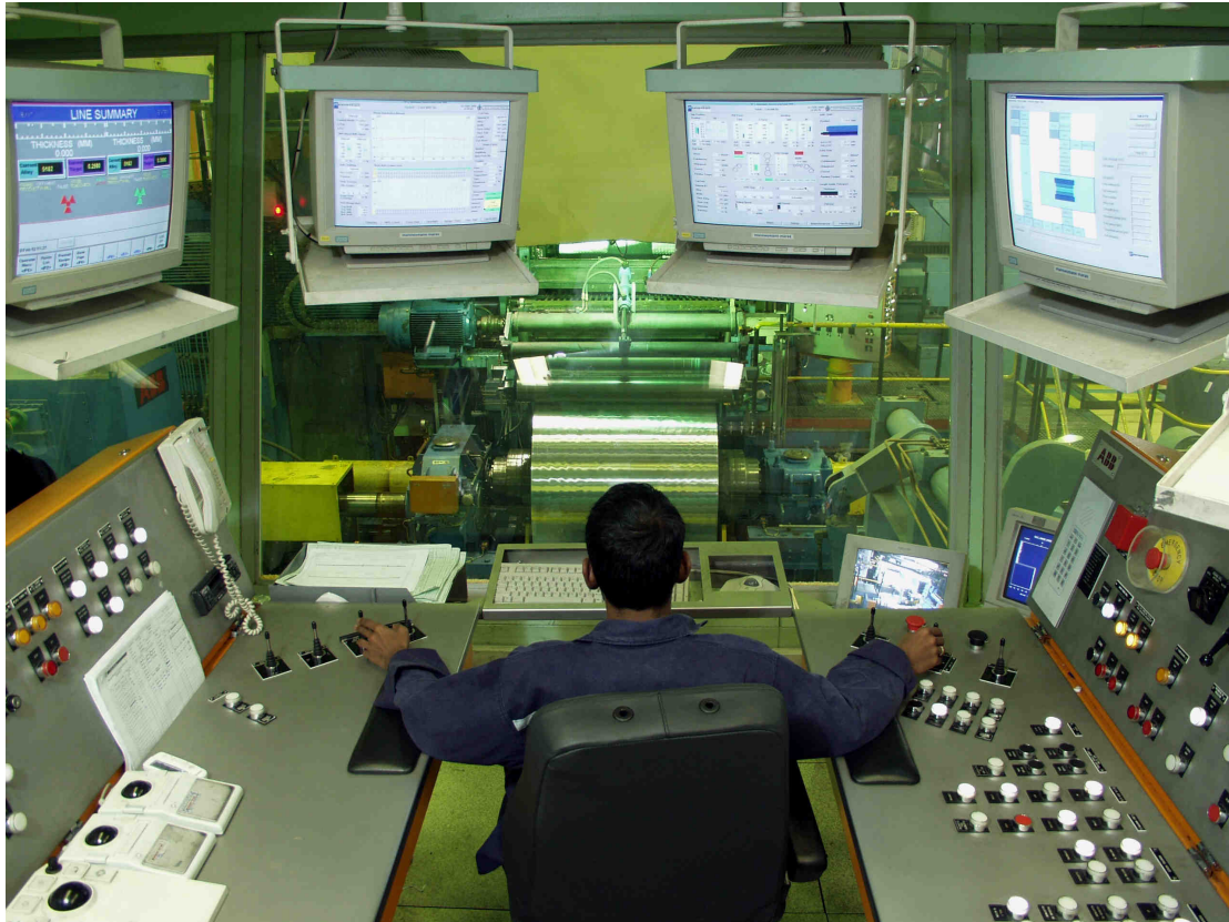
Figure 3. Hulamin's S6 mill pulpit