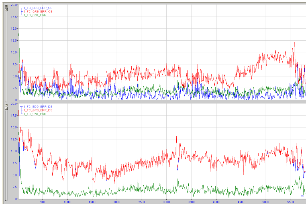
Figure 2. Maximum flatness errors for regions over the strip width for one final pass coil

Note: The dips in the data correspond to unscheduled downtime on the mill