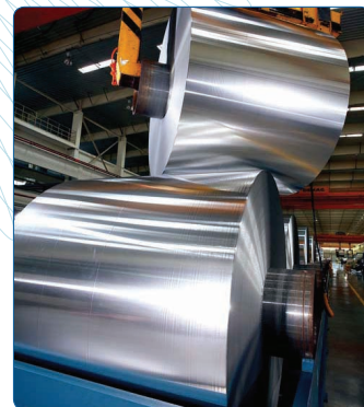
Rolls of aluminium foil at Xiashun