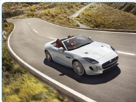
The modern-day aluminium Jaguar F-Type