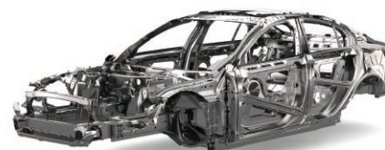
Jaguar XE monocoque BIW

This 3-day training course goes hand-in-hand with the K-Map. It serves as an introduction to automotive sheet manufacture for companies who are new to this product. A typical agenda is shown in the table below.