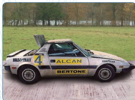
Early Banbury project with Bertone Fiat on an aluminium X19 (1986)

Recollections is available to read via Innoval's web site and I'd thoroughly recommend it.